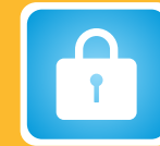
24 hr. Security