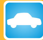
Covered Car Park