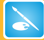
Artistically done elevation