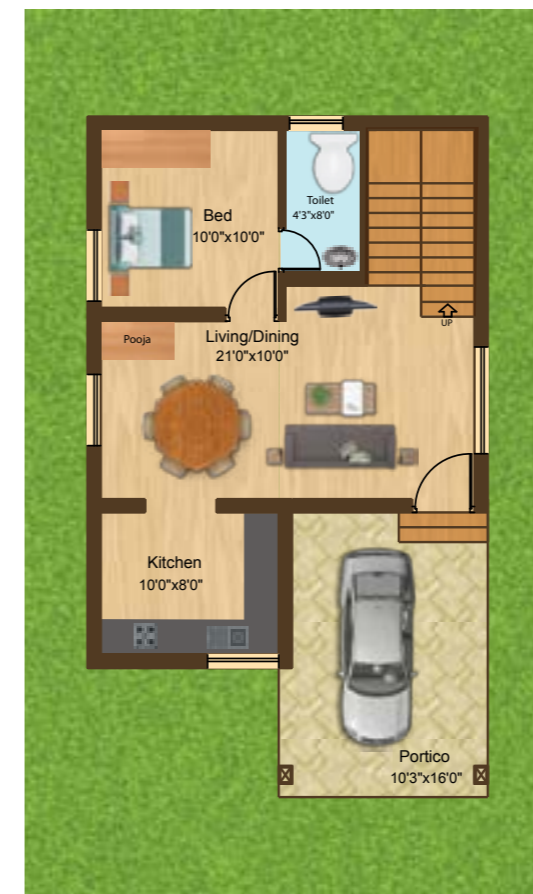
ROAD GROUND FLOOR PLAN