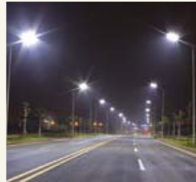
Thar Road and Street Lights