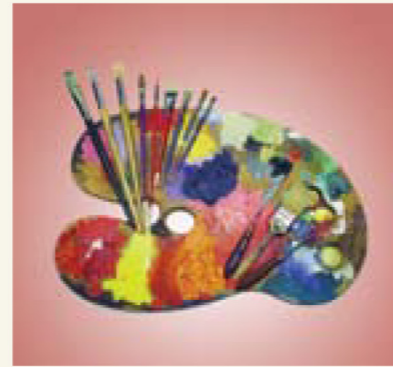
Artistically Done Elevation