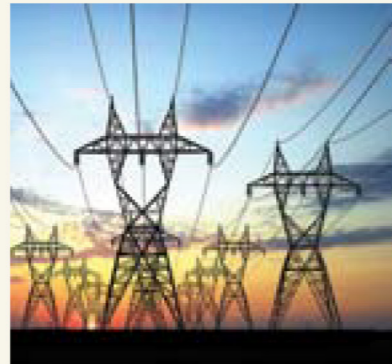
100% Power backup